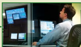
...to AlarmNet Network