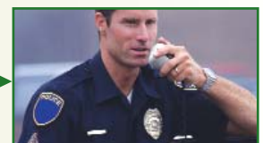
...to Response Team