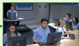
...to Central Station